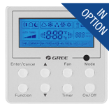
Wired controller (XE-71)