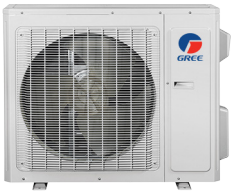
Extreme condensing unit