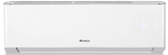
Extreme wall-mounted unit